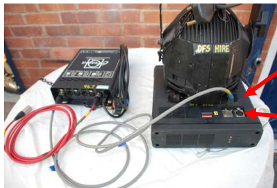
4 POLE XLR CABLE TO IN SOCKET