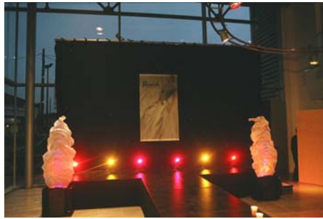
FASHION SHOWS FOR FENWICKS AND BEXLEY AGE CONCERN