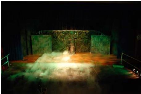
INTO THE WOODS