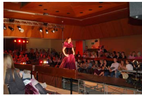
MY FAIR LADY