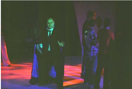
BLACK WEDDING AT THE UNIVERSITY OF CUMBRIA