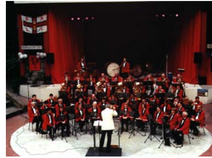
WOODLEY CONCERT BAND