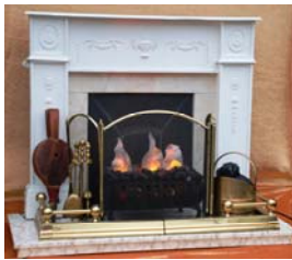
1.2M X 1M X 500

THE PLAY IS SET IN BROOKLYN NEW YORK IN THE LIVING ROOM DESCRIBED THUS "AS VICTORIAN AS THE LADIES WHO LIVE THERE". WE HAVE MADE SOME SUGGESTIONS FOR SET DRESSING WHICH WOULD BE APPROPRIATE. SOME THINGS SUCH AS A WINE BOTTLE HAVE BEE LEFT OUT AS YOU MAY HAVE THESE ALREADY.