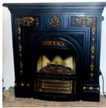
1M X 1M X 225MM DEEP