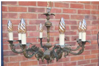
APP 550MM DIAMETER X 300MM HIGH

DESCRIPTION: BRASS 8 BRANCH CHANDELIER QUANTITY: 2 PRICE EACH PER WEEK: £ 30.00 NOTES: APP 700MM DIA X 500MM DROP PLUS CHAIN. 8 CANDLE LAMPS @ 40 WATT SEE ALSO TYPE 654