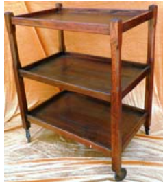
700MM X 420MM X 800MM HIGH

NOTES: WOODEN FRAME. "WHEN WE ARE MARRIED" OR YOU COULD DO "TAKE YOUR PICK" AT THE NEXT PTA EVENT, NOW THERE'S AN IDEA ! FOR YOUNGER READERS, SEE YOU TUBE.