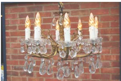
APP 550MM DIAMETER X 400MM HIGH

DESCRIPTION: 8 BRANCH BRASS CHANDELIER QUANTITY: 1 PRICE EACH PER WEEK: £ 30.00 NOTES: MAINS OPERATED SPECIAL TWISTED SMOKEY CANDLE LAMPS