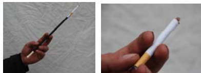
SOME SAY CHURCHILLIAN AND SOME DELBOY!

DESCRIPTION: GLOBE (DRINKS CABINET) QUANTITY: 2 PRICE EACH PER WEEK: A. £ 20.00 B, £25.00 NOTES: DRINKS NOT INCLUDED!!!! A. 3' HIGH, GLOBE IS 14" DIAMETER. B. 3' HIGH, GLOBE IS 20" DIAMETER