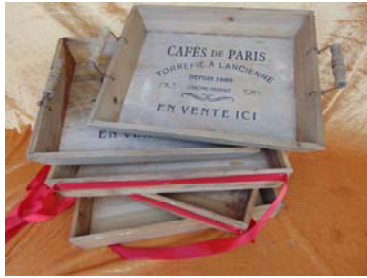
400MM X 300MM X 50MM