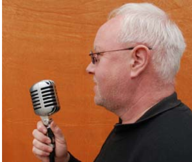
FOR THE GIRL SINGERS

DESCRIPTION: 1934 CATHEDRAL RADIO QUANTITY: 1 PRICE EACH PER WEEK: £ 15.00 NOTES: MODERN REPRODUCTION BUT LOOKS GOOD AND HAS A MODERN TRANSISTOR RADIO IN IT. THE SOUND IS GREAT!