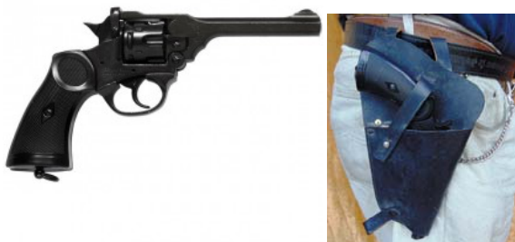
CAN HAVE HOLSTER TYPE 845

DESCRIPTION: MODERN GUN QUANTITY: 4 PRICE EACH PER WEEK: £ 20.00 NOTES: REPLICA.....IT CANNOT FIRE! BUT CONDITIONS APPLY!