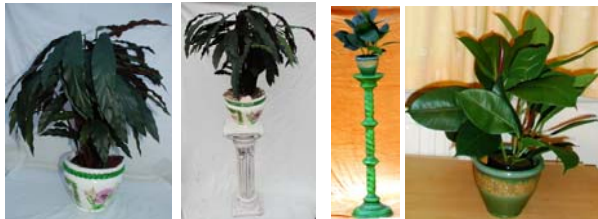
OVERALL HEIGHT APP 1.5M

DESCRIPTION: WICKER BASKETS QUANTITY: VARIOUS PRICE EACH PER WEEK: £ 8.00 NOTES: CURRENT STOCK : 1 LOG, 3 RECTANGULAR, 3 TRUG, 1 SQUARE SHOPPING AND 1 OVAL PICNIC.