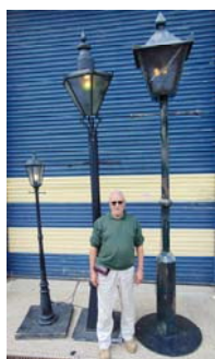
SMALL 2.4M LARGE 4.3M, 4.5M

TYPE 94 MAINS OPERATED DESCRIPTION: LAMP POST QUANTITY 1 OFF EACH CANNOT SEND BY CARRIER PRICE PER WEEK: LARGE £ 40.00 SMALL £ 25.00 NOTES :