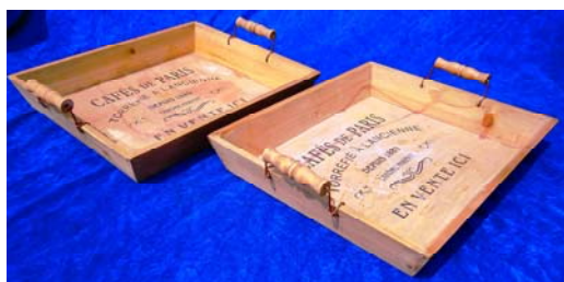
400MM X 300MM X 50MM

TYPE 755 DESCRIPTION: JUGS QUANTITY: 4 PRICE EACH PER WEEK: £ 5.00 NOTES: APP 400MM HIGH