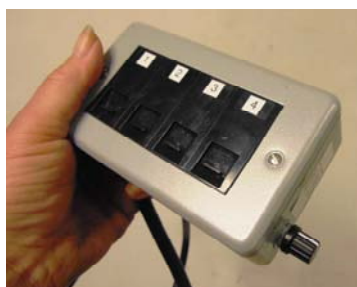
SUCH AN EXCITING PHOTOGRAPH !.....NOT

NOTES: WILL RING MOST OF OUR PHONE STOCK. MANUAL OPERATION. LETTER C IN MORSE CODE GIVES....BRING, BRING!