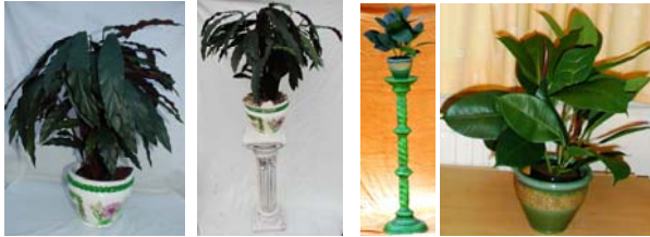
OVERALL HEIGHT APP 1.5M

DESCRIPTION: WICKER BASKETS QUANTITY: VARIOUS PRICE EACH PER WEEK: £ 8.00 NOTES: CURRENT STOCK : 1 LOG, 3 RECTANGULAR, 3 TRUG, 1 SQUARE SHOPPING AND 1 OVAL PICNIC.