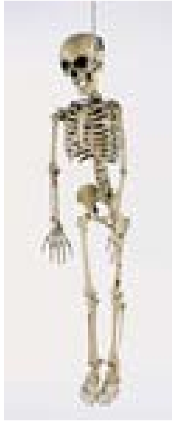
PIRATE 1.53M HIGH PROBABLE PRICE £25.00