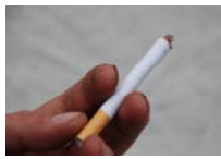
SOME SAY CHURCHILLIAN AND SOME DELBOY!