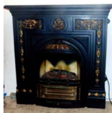
1M X 1M X 225MM DEEP