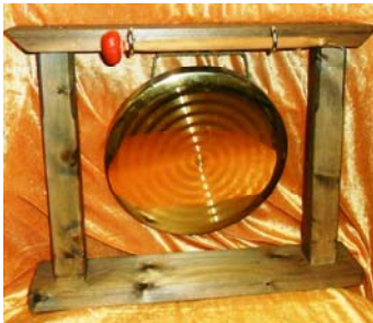
NEW PHOTO SOON

AND IF YOU CAN FINISH THE LINE, THEN YOU'RE OLD, LIKE ME!