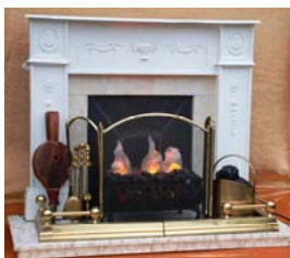
1.2M X 1M X 500

DESCRIPTION: CANDLESTICK TELEPHONE (8) QUANTITY: 1 BRASS AND BLACK, 2 ALL BLACK 1 SILVER, 3 BRASS PRICE EACH PER WEEK: £ 18.00 NOTES: RINGS WITH OUR TYPE 321. "MY FAIR LADY"? "THE BOYFRIEND"? NICE RING!