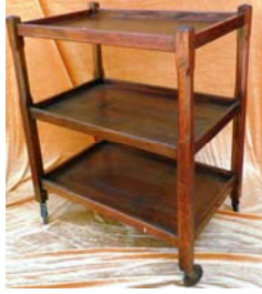
700MM X 420MM X 800MM HIGH