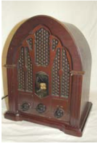
APP 300 X 200 X 400MM HIGH

DESCRIPTION: BLUE 1940'S £1 NOTE QUANTITY: 1 PRICE EACH PER WEEK: £ 4.00 NOTES: THIS IS A REAL NOTE. NO RIPS TEARS OR CREASES PLEASE! IT WAS BLUE TO STOP FORGERIES COMING FROM NAZI GERMANY.