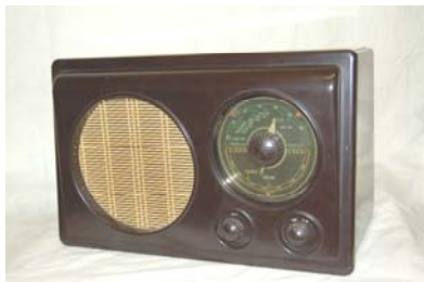
APPROX 480 X 250 X 270MM

DESCRIPTION: 1934 CATHEDRAL RADIO QUANTITY: 1 PRICE EACH PER WEEK: £ 15.00 NOTES: MODERN REPRODUCTION BUT LOOKS GOOD AND HAS A MODERN TRANSISTOR RADIO IN IT. THE SOUND IS GREAT!