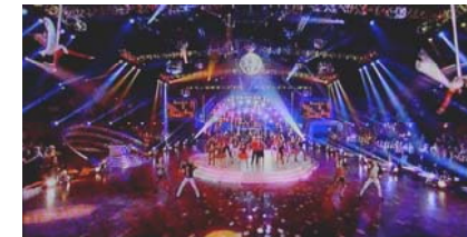
AND WHO COULD FORGET WEMBLEY?

PLEASE MEASURE THE SIZE OF THE GET IN DOOR AND ROUTE AS IT IS SO EMBARRASSING TO FIND...."THE BIG MIRROR BALL WON'T FIT"