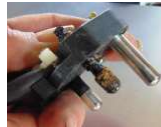
LIVE LOOSE, BURNT PIN