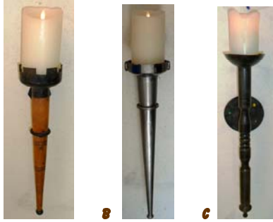
A B C 650MM X Ø150MM X 170MM STAND OFF FROM WALL