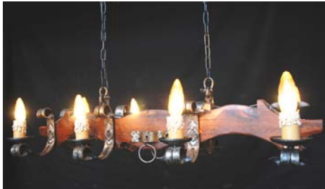
1M LONG X 500MM WIDE X 250 MM HIGH WITH 500MM CHAINS

DESCRIPTION: LARGE FLAMBEAUX QUANTITY: 2 PRICE EACH PER WEEK: £ 25.00 NOTES: MAY WALL MOUNT OR POLE MOUNT, DRESSING TO FOLLOW. MAINS.