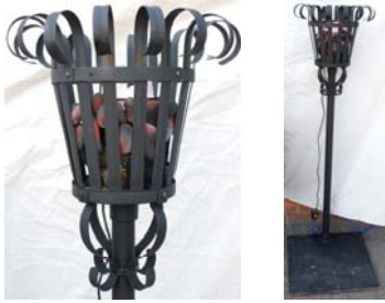
Ø450 1.7M TALL X 600MM SQUARE BASE