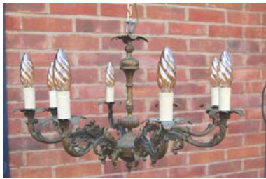
APP 550MM DIAMETER X 300MM HIGH

DESCRIPTION: 8 LAMP BARONIAL CHANDELIER QUANTITY: 3 PRICE EACH PER WEEK: £ 25.00 NOTES: HAS 8 TWISTED SMOKEY CANDLE LAMPS,