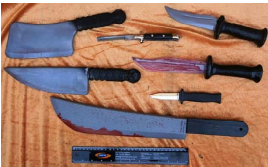
NEW PHOTO TO FOLLOW

DESCRIPTION: TRUG/BASKET OF BREADS QUANTITY: 1 PRICE EACH PER WEEK: £ 15.00 NOTES: